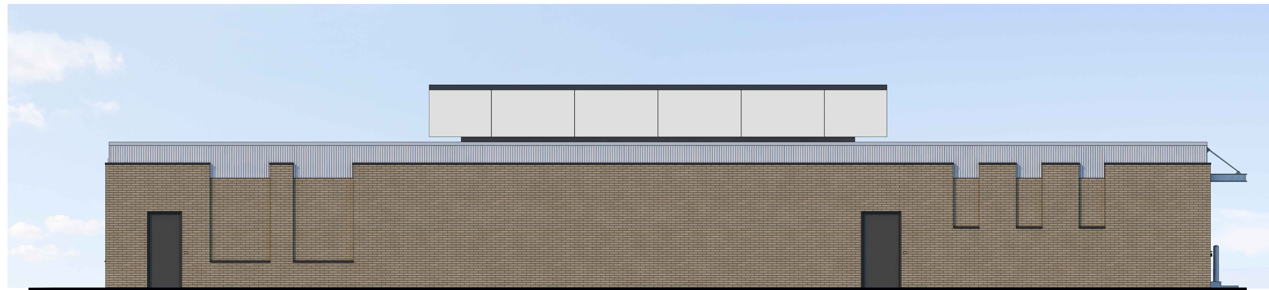
4 EAST ELEVATION SCALE: 1/4" = 1'-0"

gka ARCHITECTS, P.C. Gary Kliesch and Associate Architects 36 Ames Avenue Rutherford, NJ 07070 Tel. 201.896.0333 Fax. 201.896.9469 email@gkanda.biz