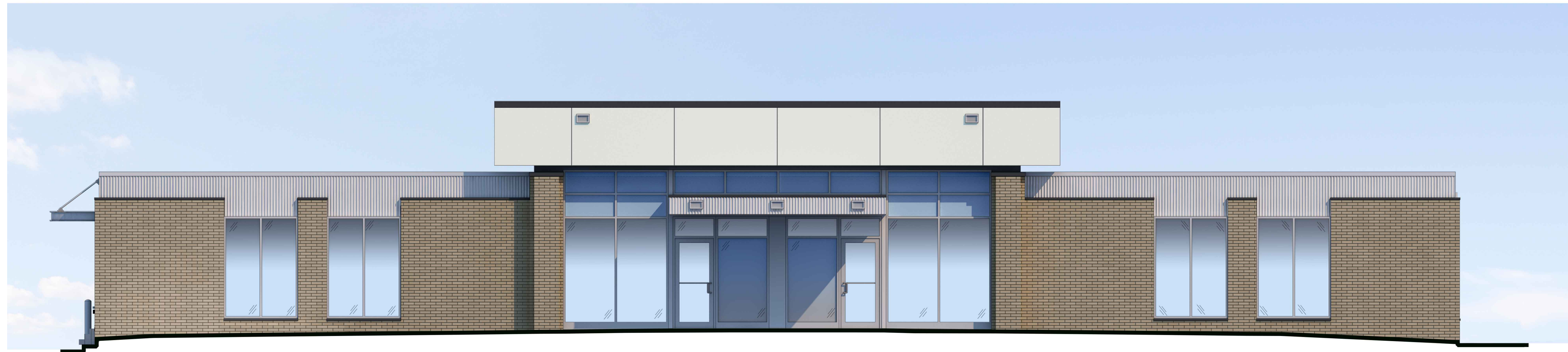
1 WEST ELEVATION (facing Route 9W) SCALE: 1/4" = 1'-0"