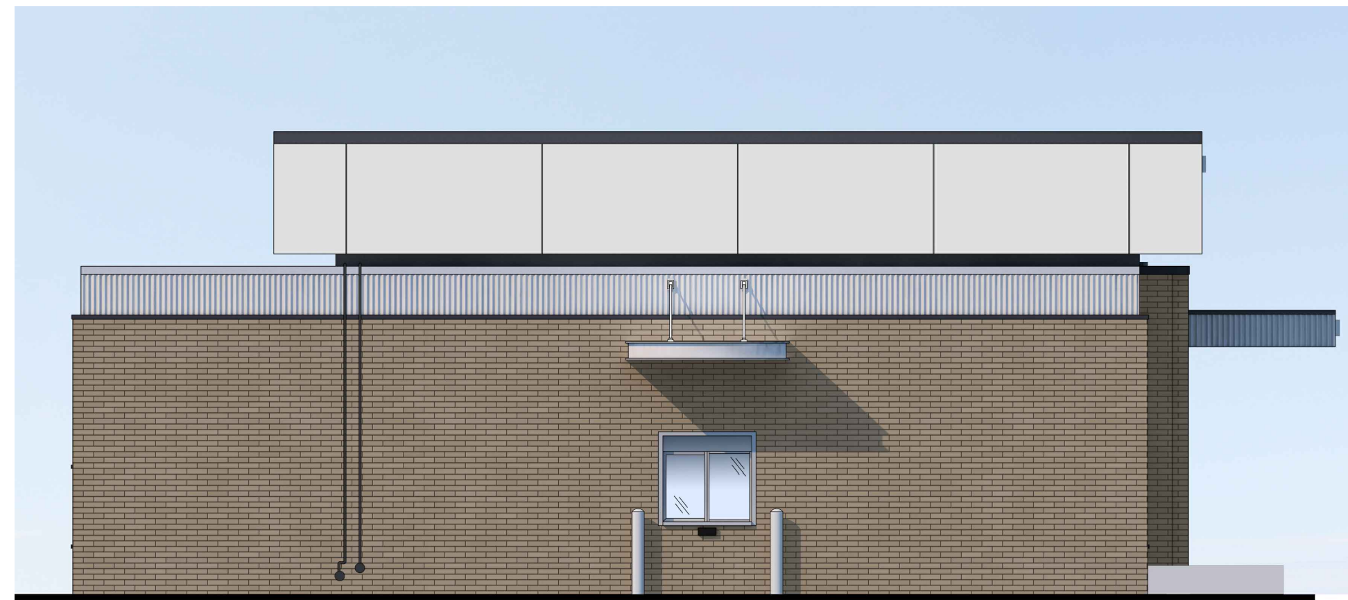
2 NORTH ELEVATION SCALE: 1/4" = 1'-0"