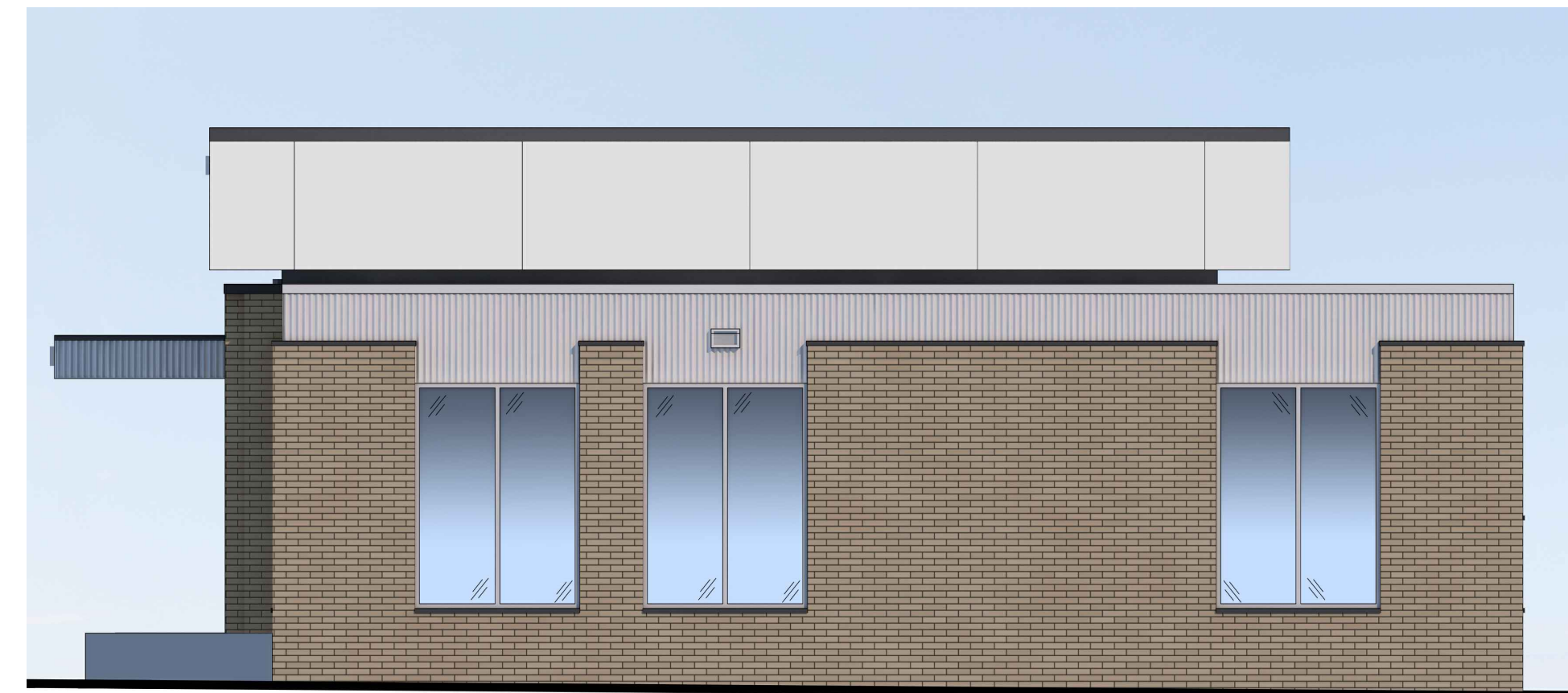
3 SOUTH ELEVATION SCALE: 1/4" = 1'-0"